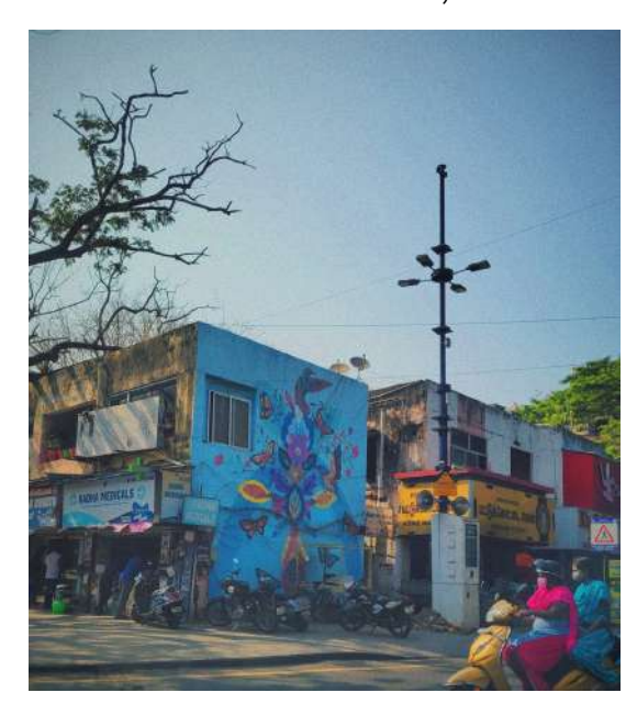
WALL ART BY URJA SETHIA, 11 A