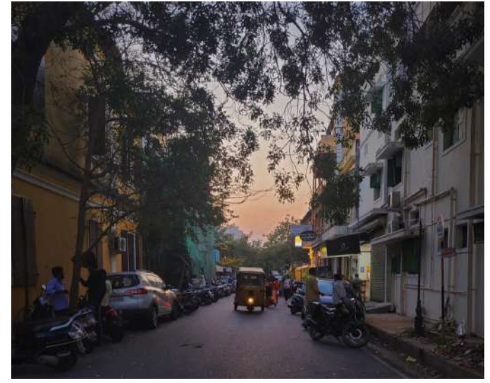
CITY LIFE BY URJA SETHIA, 11-A