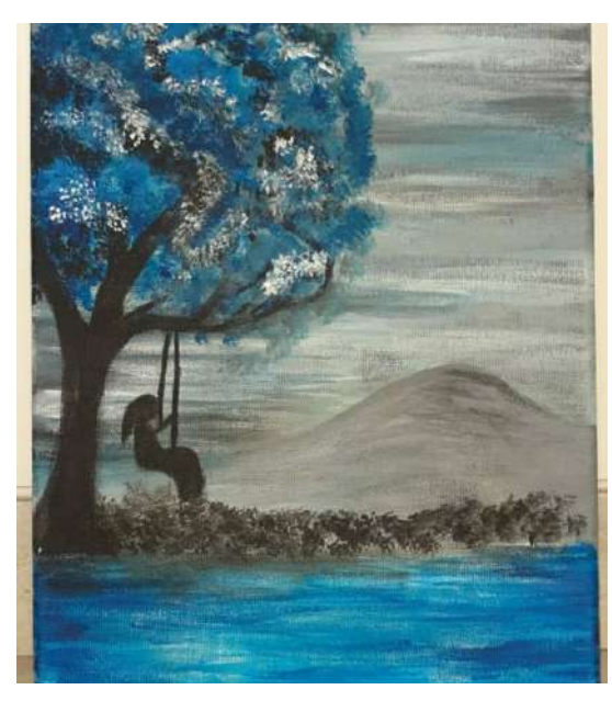
SILHOUETTES BY GRETHI GADIYA, 11-D