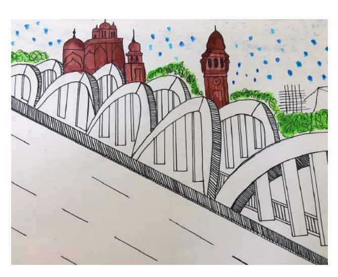
NAPIER BRIDGE BY DEEPTI ASWANI, 11-C