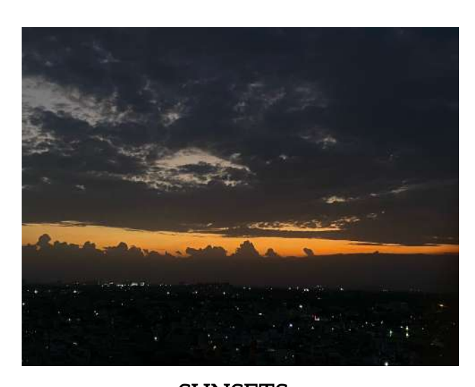
SUNSETS BY JIYA JAIN, 11-B